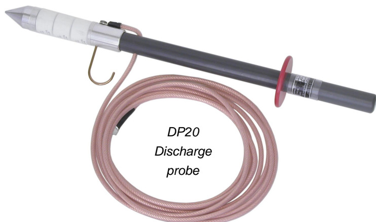
DP20 Discharge probe

The DP20 and DP40 discharge probes are designed for discharging high voltage cables after testing. The probes are supplied as standard accessories for the T&R PT18-10 and PT30-10 cable test sets, and are also available separately.